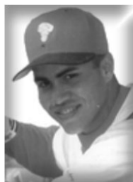
Carlos Ivan Beltran Outfielder, 1996 • Inducted 2010

Member of Opening Day starting lineup in inaugural Lugnuts game. Played 11 games with Lansing. Won 1999 American League Rookie of the Year Award. Five-time All-Star, three-time Gold Glove winner, two-time Silver Slugger in the Major Leagues.